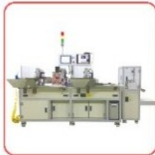
SEMI AUTO ASSEMBLER