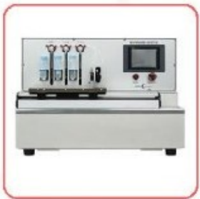
PRECISION DISPENSER (DCI-SYSTEM)