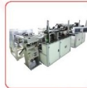
AUTOMATIC SLITTING & BOTTLING SYSTEM