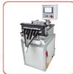
AUTO FEEDING ROTARY SLITTER