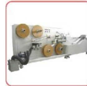
MEMBRANE LAMINATOR & CARD CUTTER (LAU-900)