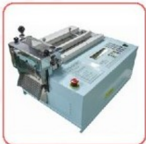
PROGRAMMABLE GUILLOTINE CUTTER