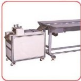
ASSEMBLY CONVEYOR & PRESSER