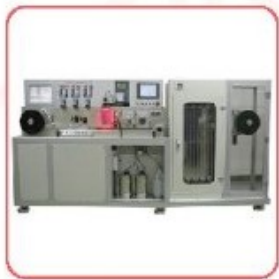
REEL TO REEL DISPENSER (DAI-SYSTEM)