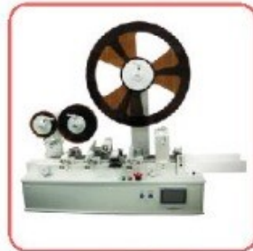
PRECISION LAMINATOR (LCI-SERIES)