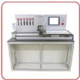
DSI-603: Flow Through Device types