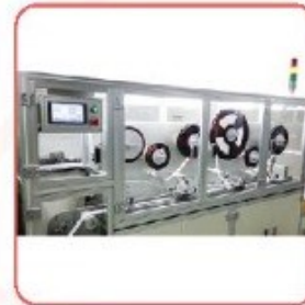
REEL TO CARD LAMINATOR (LAI-SERIES)