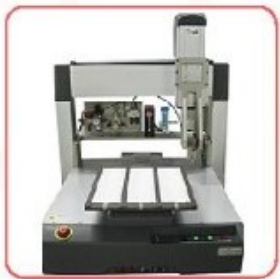
XYZ DISPENSER (DM/G-SYSTEM)